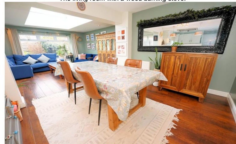
The dining area that flows to the kitchen and the family room