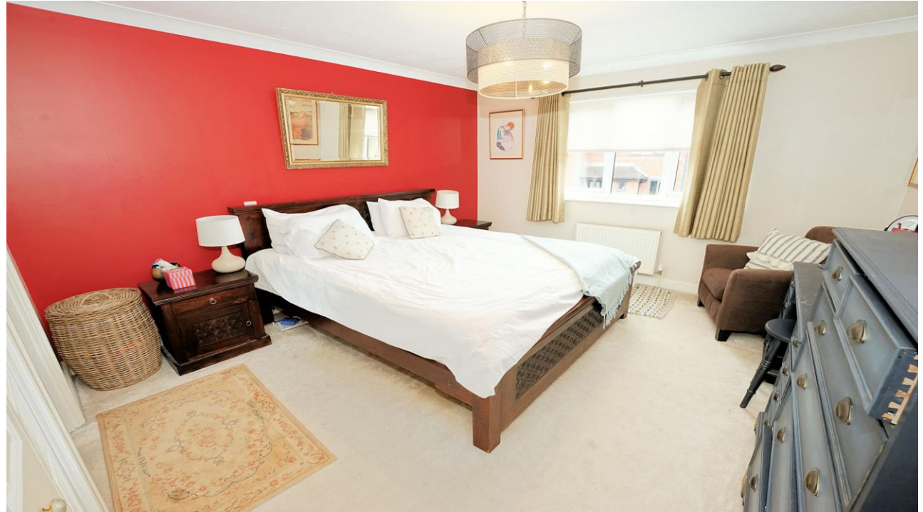
The Principal Bedroom, Dressing area and En suite

Heading to the first floor via a graceful staircase, you will discover a sanctuary of comfort. From the opulent principal bedroom suite, complete with dressing room and en-suite shower room, to the inviting secondary bedrooms, every space has been thoughtfully designed to cater to the needs of a discerning family and the layout includes a second en suite shower room off bedroom two together with a family bathroom off the landing.