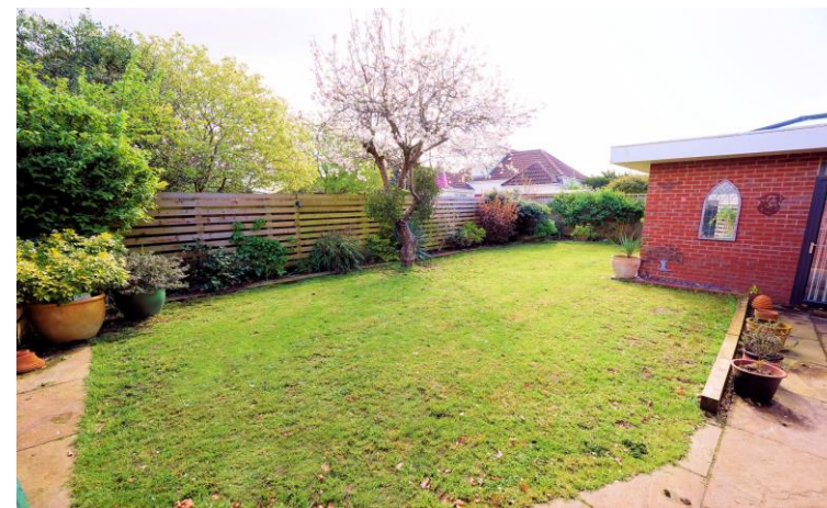
The secluded level garden.