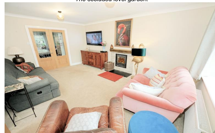
The living room with a wood burning stove.